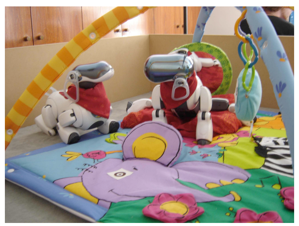
Figure 4 Curiosity-driven learning and self-organization of developmental structure in the Playground Experiment22,28. The robot in the center explores and learns to predict the effects of its actions, driven by an intrinsic motivation mechanism that drives it to focus on sensorimotor experiments that maximize learning progress/information gain. At the short time scale, this constitutes a model of curiosity-driven attention pushing the robot to prefer sensorimotor contingencies of intermediate complexity, compatible with recent experiments studying informational preferences in infants (Kidd et al., 2012). When running over an extended period of time, one observes the spontaneous self-organization of developmental phases of increasing complexity, without an initial program that specifies these phases. For example, the robot learns on its own to grasp an object in front of it, and later on focuses on exploring how to produce vocalizations that elicit reactions in another robot.

Several research teams have proposed to advance our understanding of curiosity and its impact on development by fabricating robots that learn, discover, and generate their own goals with formal models of curiosity-driven learning<sup>19-21</sup>. An example comes from the Playground Experiment (see Figure 4 and video <a href="https://www.youtube.com/watch?v=uAoNzHjzzys;">https://www.youtube.com/watch?v=uAoNzHjzzys;</a><sup>21,22</sup>). Here, a robot learns by conducting experiments: it tries actions, observes effects, and detects regularities between these actions and their effects. This allows it to make predictions. The way the robot chooses actions is like a little scientist: it chooses experiments that can improve its own predictions, which can provide new information, which makes learning progress, while continuously allocating some proportion of time to exploring other activities in a search for new possibilities. The robot is also equipped with a mechanism that simultaneously categorizes its sensorimotor experiences into different categories based on how similar they are in learnability and controllability.