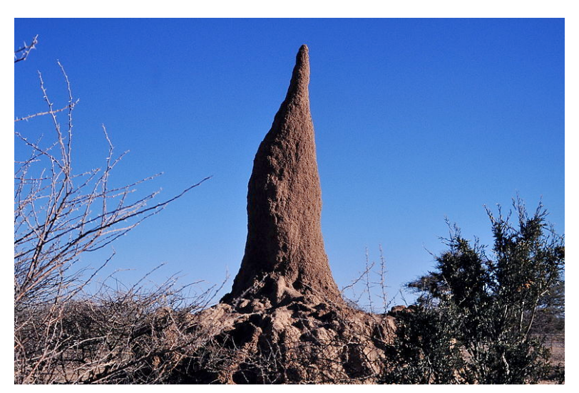
Figure 2 The architecture of termite nests is the self-organized result of local interactions among thousands of insects. None of these insects has a map of the architecture. Computer simulations contributed to understanding this process. Today, models in developmental robotics are used similarly to study how local short term mechanisms can give rise to macro and long-term behavioral and cognitive developmental structure.

Child development also involves the interaction of many components, but in a way that is probably orders of magnitude more complicated than crystal formation or termite nest construction. Hence, to complement the (tremendously useful) verbal conceptual tools of psychology and biology, researchers have begun building machines that model pattern formation in development. Such efforts can play a key role in 21<sup>st</sup> century developmental science.