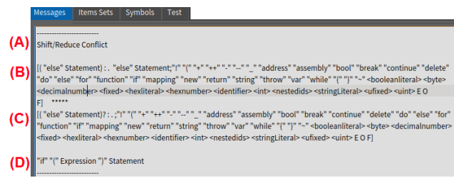
Figure 1. SmaCC Shift-Reduce Conflict Message

First, we need to identify the rule and which part of it is causing the shift-reduce conflict. Unfortunately, the message provided by SmaCC on the conflict might be difficult for a beginner to understand (Figure 1).