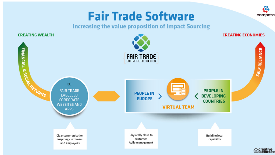
Fig. 2. Fair Trade Software Overview

identified as the area where expertise in Kenya is lacking. An international software development working-environment is replicated as closely as possible, with projects for real customers in the EU or Kenya. There is no fixed course syllabus, agenda or duration, participants work in small teams with members of varying skills and experience, and team members join or leave at random times as in a real company. Team members may be physically located in Nairobi, Kenya or The Hague, Netherlands. The first successful project to be completed at CodePamoja was a portal for foreign exchange students at The Hague University of Applied Sciences, which is now in operation. In its second year CodePamoja has begun work on a larger project to develop the Enterprise Kenya portal for the Kenyan ICT Authority.