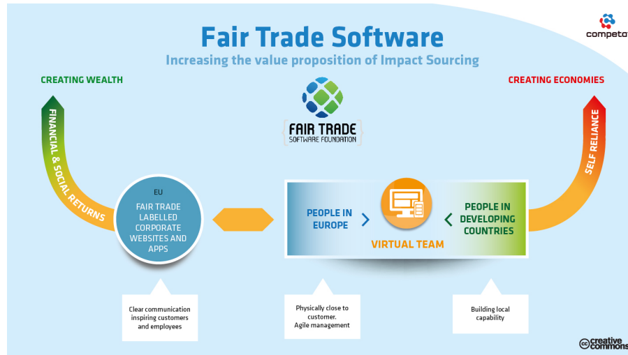
Fig. 2. Fair Trade Software Overview

identified as the area where expertise in Kenya is lacking. An international software development working-environment is replicated as closely as possible, with projects for real customers in the EU or Kenya. There is no fixed course syllabus, agenda or duration, participants work in small teams with members of varying skills and experience, and team members join or leave at random times as in a real company. Team members may be physically located in Nairobi, Kenya or The Hague, Netherlands. The first successful project to be completed at CodePamoja was a portal for foreign exchange students at The Hague University of Applied Sciences, which is now in operation. In its second year CodePamoja has begun work on a larger project to develop the Enterprise Kenya portal for the Kenyan ICT Authority.