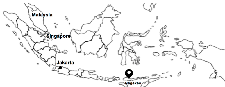
Figure 2. Map of Nagekeo: The study site

Our study site is the district of Nagekeo located in the province of East Nusa Tenggara (see Figure 1). Approximately 110,000 people inhabit this area, which covers 1,417 square km. This newly established district was part of the district of Ngada until 2007. A large proportion of this district's land is community land ( tanah ulayat ) without certificates. That often triggers land conflicts, either between tribal groups or between tribal groups and the local government [31, 32]. Nagekeo was selected in order to represent an area where conflicts concerning community land ownership are prevalent.