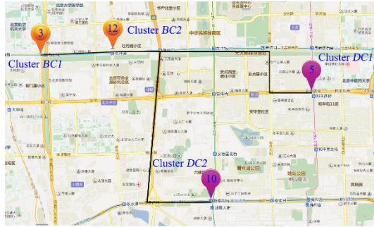
Fig. 1. The result of mining frequent OD pairs.

Fig. 1 shows the result of mining frequent OD pairs for a passenger. The yellow bubbles represent the results of clustering of frequent boarding stations. And the purple bubbles represent the results of clustering of frequent disembarking stations. The number in each bubble is the frequency of boarding or disembarking for a passenger. If the frequency in a bubble is more than 6, then the station is regarded as a frequent boarding station or disembarking station. Following this rule, clusters BC2 and DC2