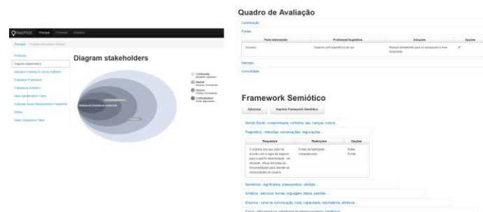
Fig. 2. The CASE tool's first version named WebPAM.

Considering that the SUS questionnaire scale ranges from 0 (worst possible score) to 4 (best possible score) mapped for Usability Goals [19], the 2012 version of the CASE tool had a score between 2 and 3 for Effective (effective to use), Efficient (efficient to use), Utility (have good utility) and Learnable (easy to learn). Memorable (easy to remember how to use), in turn, had a score lower than 2. Even though the overall results are positive, the results indicated that the CASE tool could be improved in several aspects, including usability and accessibility ones.