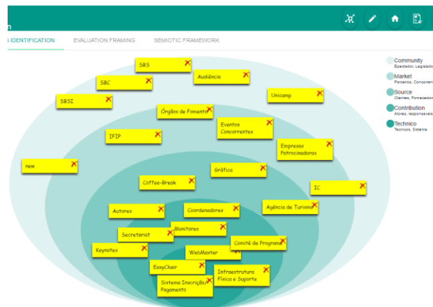
Fig. 4. SID for ICISO'16

This activity involved a group of 10 people with experience in using OS artifacts and in organizing conferences. Because the participants were experienced in both OS and the problem domain, this was considered an ideal scenario to evaluate the current version of the CASE tool in terms of possible conceptual problems, technical issues and overall usability. This scenario also highlights how the CASE tool can be used for a wide range of problem understanding contexts, not only the development of a technological product. Fig. 4 illustrates the beginning of the planning activities, in which the group uses the SID to list and map every stakeholder that is involved and may somehow affect/be affected by the conference. Participants identified and mapped stakeholders from different layers, for instance, while technical stakeholders (e.g., EasyChair) are placed in the onion's core, social ones (e.g., Audience) are placed in the outermost layer of the onion.