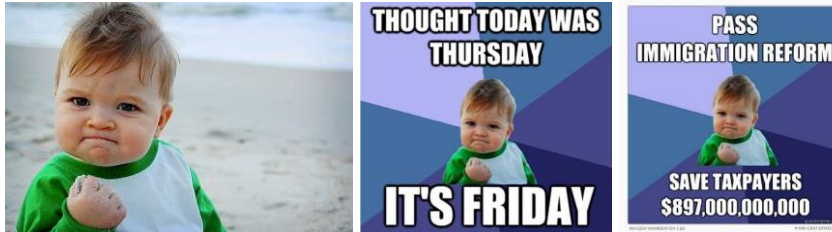
Fig. 2. From left to right: (a) original picture taken by the child's mother; (b) internet meme example; (c) meme used by the USA White House in a Tweet [Sources: (a) and (b) http://globalnews.ca/news/1939419/success-kid-needs-your-help-getting-his-dad-a-new-kidney/ ; (c) http://www.nydailynews.com/news/politics/success-kid-meme-pass-immigration-reform-article-1.1376952 , Accessed: April 2016]

in their campaign to urge Congress to pass the immigration reform (Fig. 2c) representing the impact in society.