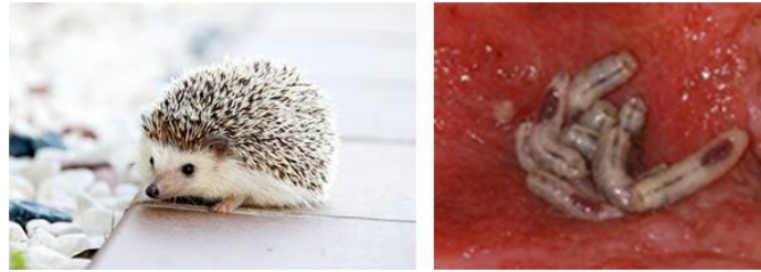
Fig. 1. In spite of its prickly appearance, a hedgehog baby 1 might have positive affective affordance, whereas maggots 2 , with its soft appearance, would evoke negative affective affordance – contrary to the notions of what spiky and smooth objects usually evoke.