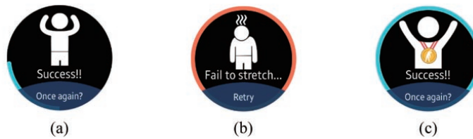
Fig. 3. Gamification elements. (a) For the success case, the progress bar is displayed at the boundary area. (b) The fail case. (c) Daily goal achievement.

The user's stretching motion can be represented by sequential time series data. We used a Hidden Markov Model (HMM) algorithm[4], which processes sequential data in real time on embedded systems. We acquired the accelerometer data at 100 Hz and used a Kalman filter to compensate for the noise in the raw sensory data. The observation vector, containing acceleration and some processed data, was evaluated in real time during the stretching action. When the users action was done, we compared the probability given by the motion recognition algorithm with the proper threshold to determine whether the user succeeded or failed. For this purpose, we need off-line pre-training stage and per-person training stage. Ten volunteers were involved in the pre-training stage. Each volunteer provided ten motions for the vertical stretch. We assume that the arm movement is symmetric and can safely rely on the data from a single sensor on one wrist.