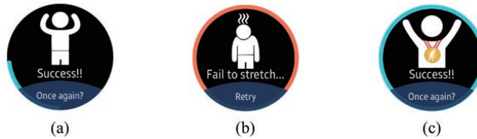
Fig. 3. Gamification elements. (a) For the success case, the progress bar is displayed at the boundary area. (b) The fail case. (c) Daily goal achievement.

The user's stretching motion can be represented by sequential time series data. We used a Hidden Markov Model (HMM) algorithm[4], which processes sequential data in real time on embedded systems. We acquired the accelerometer data at 100 Hz and used a Kalman filter to compensate for the noise in the raw sensory data. The observation vector, containing acceleration and some processed data, was evaluated in real time during the stretching action. When the users action was done, we compared the probability given by the motion recognition algorithm with the proper threshold to determine whether the user succeeded or failed. For this purpose, we need off-line pre-training stage and per-person training stage. Ten volunteers were involved in the pre-training stage. Each volunteer provided ten motions for the vertical stretch. We assume that the arm movement is symmetric and can safely rely on the data from a single sensor on one wrist.