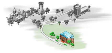
Figure 3: Student activity in physical locations

When the player physically reaches a building, the game uses GPS coordinates from the device to determine the building and change its color on the map. If available, additional localization devices such as Bluetooth beacons or Wi-Fi base stations can also be used (Fig. 3).