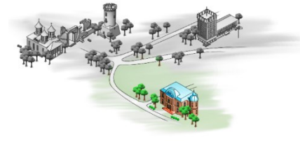
Figure 3: Student activity in physical locations

When the player physically reaches a building, the game uses GPS coordinates from the device to determine the building and change its color on the map. If available, additional localization devices such as Bluetooth beacons or Wi-Fi base stations can also be used (Fig. 3).