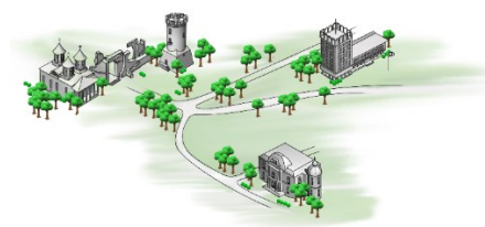
Figure 2: Student activity within the game

When the player explores the virtual world, the background images changes color for the areas the players has visited (Fig. 2).