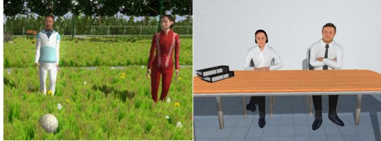
Figure 1. The virtual Cyberball-Paradigm (left) and virtual TSST (right)

with the user, in the ‘exclusion condition’, however, the avatars continue to play only with each other and further exclude the user from the game.