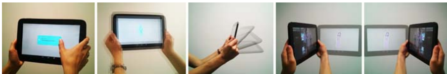
Fig. 3. Example user interactions from left to right: tap, shake, pitch, turn left & turn right

MockAR engages non-programmers in the UI design process of AR interactions, making this task accessible to a wider group of creators used to wireframing. MockAR emulates AR effects by displaying a linear order of semi-transparent images in front of camera-captured video. It makes full use of available sensors of mobile devices as input options to advance the image sequence. The image succession is determined by alphabetical order of image file names (0-9, A-Z). Transition between two images is set by an interaction keyword (e.g. shake , pitch , turnL , turnR , tap ) contained in the last six letters of the file name. In SPIRIT, we used MockAR with interactions like tapping on screen (default), shaking, pitching by 90 degrees, turning the device left and right (Figure 3), and setting a timer. A six digit number sets timed image transitions in milliseconds. Technical skills needed for using MockAR are image editing, changing file-names, saving files on an Android device and installing and starting the Android app on a mobile device. Therefore we assume MockAR is easy to use for non-programming user interaction designers.