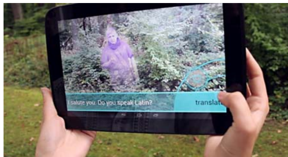
Fig. 1. Early functional prototype of the SPIRIT application

had to be redesigned for more user guidance. This interdisciplinary development afforded several stages of prototyping before the system's full implementation [1]. Easy prototyping of location-based AR experiences requires tools that go beyond existing approaches. As a side result in the SPIRIT research project, we developed the AR UI prototyping tool MockAR for the project's non-programming designers. It supports the widely known principle of 'wire framing', used to draft and test so-called click dummies in early development stages [9]. MockAR plays back image sequences that can be experienced based on a wide range of user interactions using handheld devices' sensors.