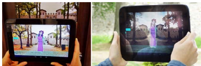
Fig. 2. Mockup UI evaluation indoors (left) and outdoors (right).

For the above-mentioned interactions, the mobile application needs to be equipped with various UI elements offering meta-information and hints for the user. As there is not a straight-forward standard solution, several optional creative design ideas are developed. In a cycle of design and formative evaluation, these alternatives need to be tested long before final implementation. In traditional interactive media (such as for desktop, web and touch applications using point-and-click or tap interaction), so-called wireframes are created with basic tools [9] as simple as for example MS-PowerPoint. The result can be experienced clicking linearly through ideal progressions of use, mostly at the desktop. This approach has been used at first, however it is limited for experiencing location-based AR issues. These include the difference between lighting and readability conditions indoors vs. outdoors (see Figure 2), the handling of the device including holding its weight and reach space for touch interaction, as well as issues concerning the specificity of the outdoor location, far away from office space. To fill this gap, we developed MockAR, an application to be used for low-fidelity prototyping of UI design alternatives.