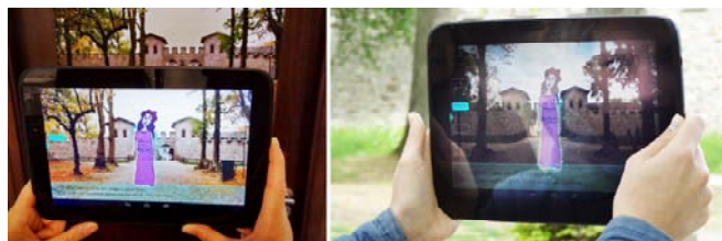
Fig. 2. Mockup UI evaluation indoors (left) and outdoors (right).

For the above-mentioned interactions, the mobile application needs to be equipped with various UI elements offering meta-information and hints for the user. As there is not a straight-forward standard solution, several optional creative design ideas are developed. In a cycle of design and formative evaluation, these alternatives need to be tested long before final implementation. In traditional interactive media (such as for desktop, web and touch applications using point-and-click or tap interaction), so-called wireframes are created with basic tools [9] as simple as for example MS-PowerPoint. The result can be experienced clicking linearly through ideal progressions of use, mostly at the desktop. This approach has been used at first, however it is limited for experiencing location-based AR issues. These include the difference between lighting and readability conditions indoors vs. outdoors (see Figure 2), the handling of the device including holding its weight and reach space for touch interaction, as well as issues concerning the specificity of the outdoor location, far away from office space. To fill this gap, we developed MockAR, an application to be used for low-fidelity prototyping of UI design alternatives.