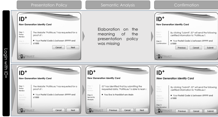
Fig. 2. Experiment Process