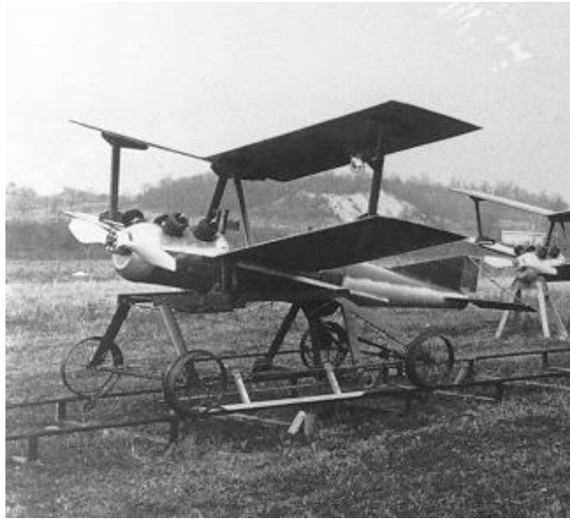
Fig. 1. Kettering Bug one of the first UCAV's from late 1910's 1 .

idea of this solution was based on a hot-air balloon with a basket filled with explosives. This material was to be dropped on the enemy using a mechanism activated by the clock mechanism. Also, one of the first ideas of an unmanned airplane was strictly connected with army solutions in the war time. In 1916 the first airplane controlled by radio waves from the ground was created. Just a few days after the USA officially entered World War I in 1917 the American Army commissioned work on Unmanned Combat Aerial Vehicles (UCAV) [1]. Those first unmanned flying bombs based on biplane airplanes. There were several problems with those first UCAV's. One of the biggest problem was the limited aerodynamic knowledge in those times. It was almost impossible to build well flying unmanned airplane just less than twenty years after the first flight of the Wright Brothers [2].