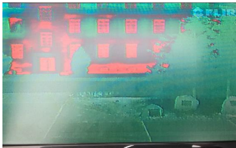
Fig. 3. Thermal image of one of the buildings in General Tadeusz Kościuszko Military Academy of Land Forces

Today, unmanned flying platforms are becoming increasingly popular due to the significant decline in prices . The use of a no - manned airborne platforms to shoot footage in high quality becomes widespread. Increasingly used unmanned platforms to support a number of projects, such as the inspection of hard to reach places with the use of video cameras and thermal imaging.