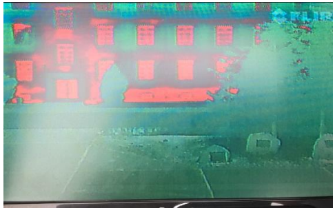
Fig. 3. Thermal image of one of the buildings in General Tadeusz Kościuszko Military Academy of Land Forces

Today, unmanned flying platforms are becoming increasingly popular due to the significant decline in prices. The use of a no - manned airborne platforms to shoot footage in high quality becomes widespread. Increasingly used unmanned platforms to support a number of projects, such as the inspection of hard to reach places with the use of video cameras and thermal imaging.