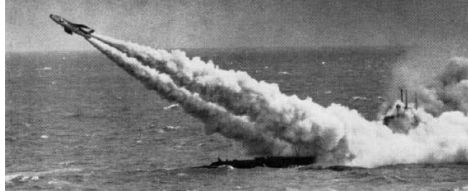
Fig. 2. RGM-6 Regulus I from 1958 2 .

Starting from the 90's of the twentieth century drones (due to the development of electronics and IT) began to increasingly appear more numerous and in the arenas of armed conflict. It is sufficient to mention here the participation of the Israeli-American unmanned aerial vehicles RQ-Pioneer in such operations as "Desert Shield" "Desert Storm", or "UNSOM II".