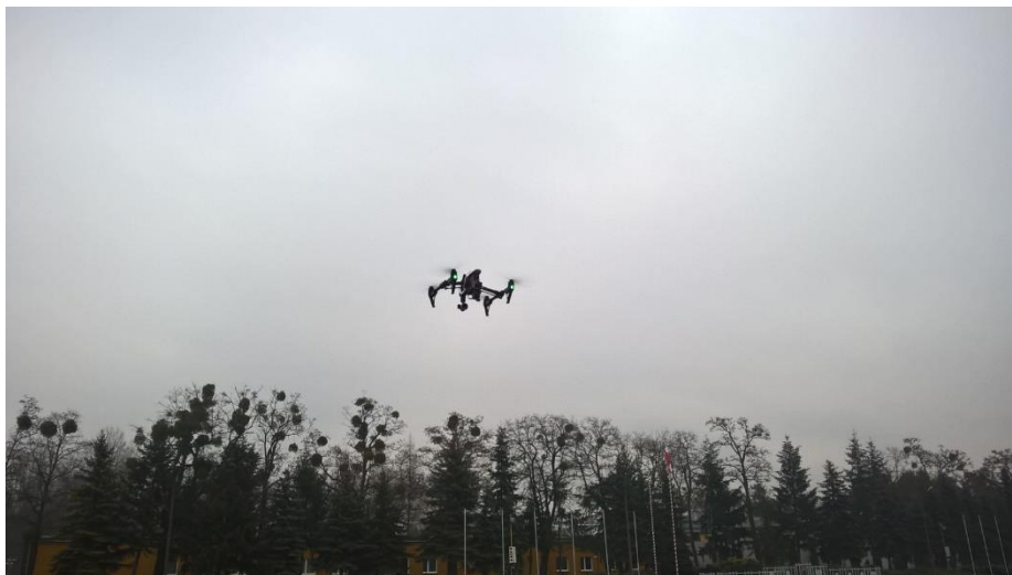
Fig. 4. DJI Inspire 1 quadrocopter

There are several types of civil UAV nowadays, but one of the most popular are multicopters. They are stable and easy for steering machines with the ability to hover in the given point of three-dimensional space. There are several types of multicopters but the most popular since to be quadrocopter. That is a multicopter with four vertically oriented propellers. We choose quadrocopters because of its relative low costs and the ability to immediately change the direction of flight.