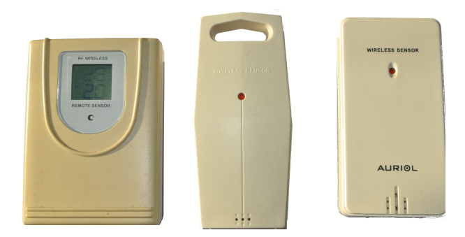
Fig. 1. The wireless sensors used for the evaluation (left-to right): H13716A-TX, Z31130-TX and Z31915-TX

not requiring values which would mandate the mantissa and exponent approach, or the problematic (or missing) implementation of floating-point operations on such simple hardware.