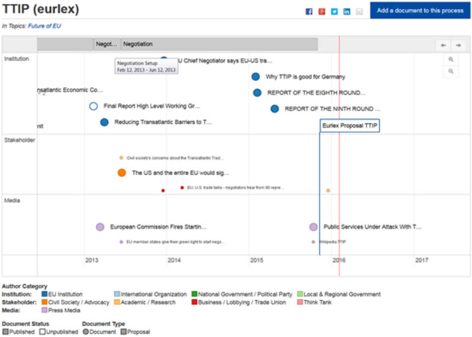
Fig. 2. PolicyLine timeline visualization

In particular, PolicyLine provides statistical information for each policy process selected by the user, such as the total number of relevant documents and the number of visits of users on the specific policy process page. For a more detailed view, PolicyLine offers a timeline visualization (see Figure 2), which structures the main documents (based on relevance as well as author's reputation) associated with this policy process in a temporal order, and clusters them under a set of user defined stages of the particular policy process. It also provides information with respect to their authorship (colors are used for this purpose to reflect different authors' categories and sub-categories), and also shapes (such as rectangles and circles) to reflect different types of documents (e.g. rectangles reflect the proposal documents, while general documents are represented by circles). Documents sub-categories are defined concerning the type of organization from which each document is originated (e.g. European Institution, National/Local Governance, Academic Institution, Civil Society Organization, Media, etc.). The sizes of the shapes representing these documents reflect their relevance and author's reputation (so more relevant documents written by more reputable authors are shown bigger).