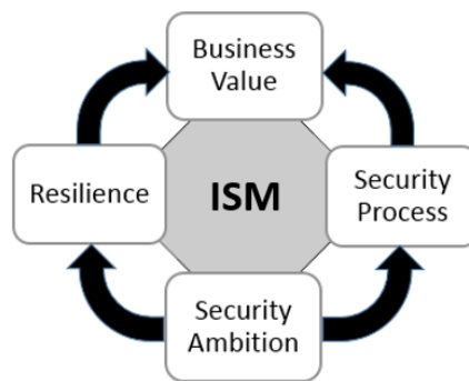
Fig. 1. Structure of the Information Security Management (ISM) assessment framework

The ISM assessment framework consists of four main dimensions that are illustrated in Figure 1. The first dimension was called Security Ambition (SA) and refers to the potential or future perspective of the BSC. The second dimension is called Security Process (SP) and is based on the internal process perspective of the BSC. The third Resilience (RE) perspective is based on the customer perspective of the BSC. Finally, the Business Value (BV) refers to the financial or value perspective of the BSC. These dimensions and their reasoning are described next.