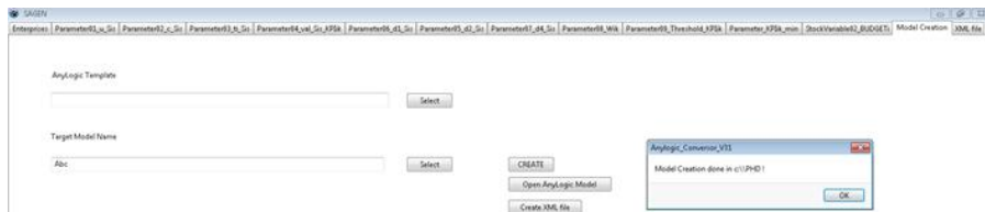
Fig. 2. SAGEN User Interface