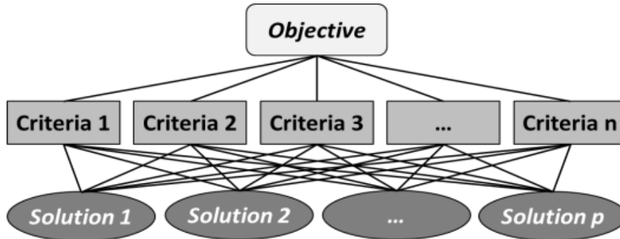
Fig. 2. Example of a criteria and solutions hierarchy.

AHP applies a criteria pairwise comparison based on decision maker judgement, creating the Saaty 1-9 scale to define the criteria priority. In which qualifying a criterion with 1 indicates equal importance, and 9 extremely important. With an n criteria and p solutions it is achieved a decision matrix of p*n size, in which the \{d_{pn}\} element indicates the value for p th solution in respect to the n th criteria. The pairwise comparison matrix is a m*n size, in which the \{v_{mn}\} element indicates the value for m th criteria in respect to the n th criteria. Normalized comparison matrix has its elements calculated as follows: Nv_{pn}=v_{pn}/w_n ; w_n=\sum v_{pn} , p=1, 2 \dots . The contribution of each criteria n for the problem objective, i.e. the eigenvector, is then computed as: CW_n=\sum w_n/n , n=1,2 \dots [13]. Identified the eigenvector, is then possible to rank the solutions through a simple matrix multiplication, i.e.: the decision matrix multiplied by the eigenvector.