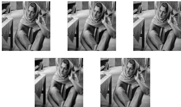
Fig. 1: Top line: exact image (left), Gaussian blurred image (middle) and MNP reconstruction (right). Bottom line: out-of-focus blurred image (left) and MNP reconstruction (right). The noise level is NL=7.5 \cdot 10^{-3} .