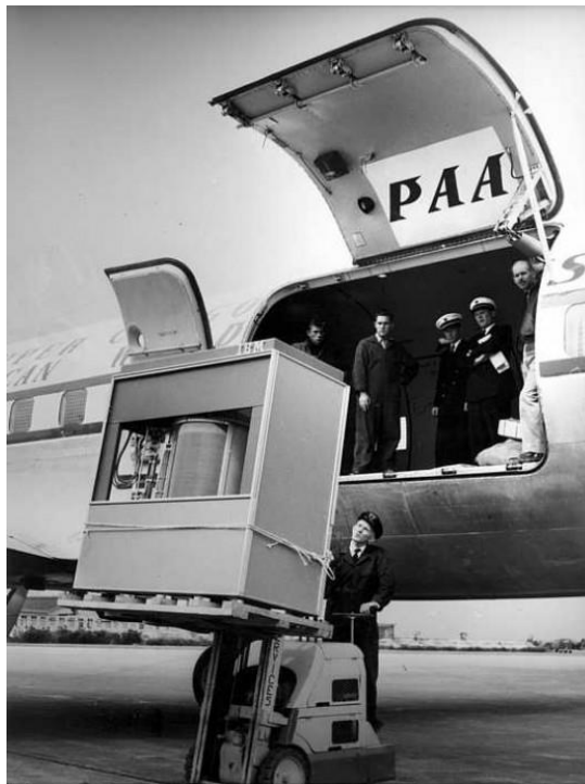
Fig. 1. Flying the RAMAC 305: An IBM 350 disk unit, weighing a bit over a ton, being forklifted onto a Pan American Airways operated Douglas freighter aircraft (most possibly a DC-6A), ca. 1956

How is technology transferred? Both as a physical artefact and as intangible knowledge? What is actually transferred and through which channels? Who lays claims to it and who benefits from this process? In other words, what is to be lost and gained through such transfers? These are some of the main questions this paper will try to answer; a paper that traces the “diplomatic missions” of the RAMAC 305, a computer designed by the International Business Machines Corporation (IBM) in California during the late 1950s.