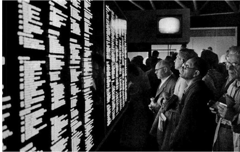
Fig. 7. Russian visitors going through the backlit panels of questions that the RAMAC 305 could answer. Notice the closed-circuit television screen at the top center-right displaying answers being printed in real time. (Source: Life , v. 47, no. 6, (August 10, 1959)).

whole demonstration was set-up to give the impression of a machine capable of responding after “thinking,” in line with Watson senior’s famous slogan for the company.