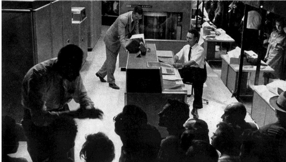
Fig. 9. General overview of the overall layout of the IBM stand with the RAMAC 350 disk unit (center, back), the 380 console (center, middle), four office desks with electronic typewriters (right) and crowds being given tours in Russian.

the grey-colored computer and the Russian audience, mediated through IBM's grey-attired business representatives.