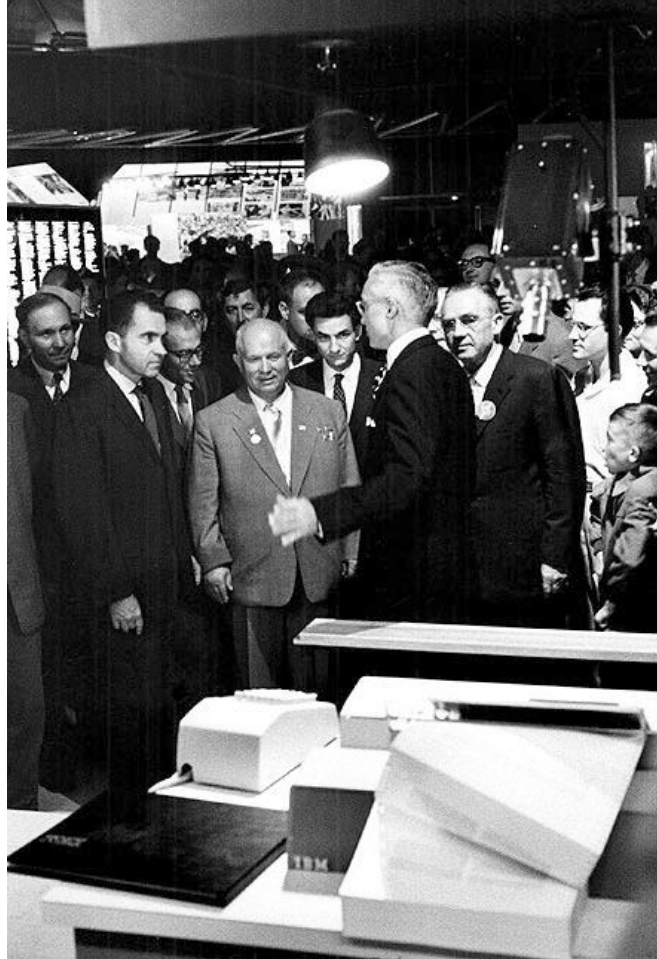
Fig. 6. “IBM World Trade President Arthur K. Watson [on the right of Khrushchev] describes the operation of the RAMAC 305 to U.S. Vice President Richard Nixon and Soviet Premier Nikita Khrushchev.” (Source: Business Machines , vol. 42, no. 9 (September 1959)).

Crowds of more perplexed rather than curious Soviet visitors swarmed around the output devices of the system – four electric typewriters encased in bright red plastic. For those unable to secure a spot in front of the printer to witness the uncanny moment when the printer would start putting Cyrillic characters on paper to form answers that “satisf[ied] the curiosity” 11 of the onlookers, a zoom-lens camera fixed right above the printer ensured that answers simultaneously appeared on the overhead displays of a closed-circuit television system in real time. 12 (Figure 8) Even if the computer in reality merely retrieved the corresponding answer from its hard disk, the