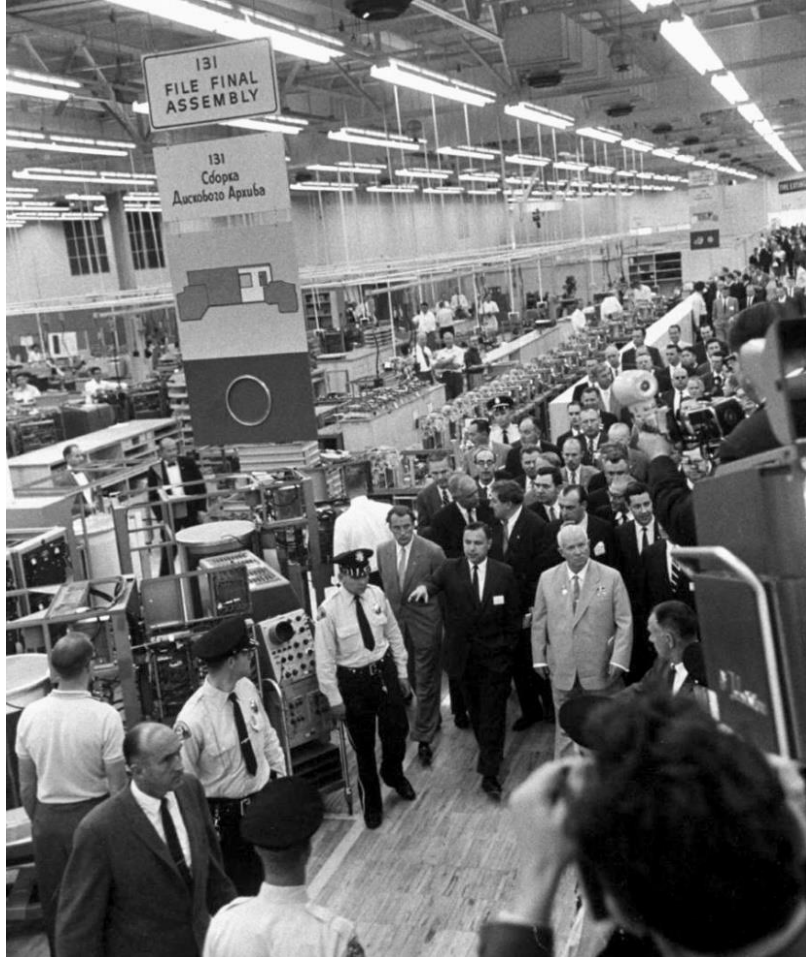
Fig. 10. Nikita S. Khrushchev walking through the RAMAC assembly line with his entourage.

Recalling his discussion with Khrushchev through the assembly line, Watson Jr. wrote in his memoirs: