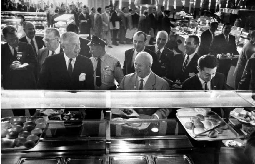
Fig. 11. Thomas Watson Jr. and Nikita S. Khrushchev laughing at the self-service cafeteria of the IBM plant in San Jose, California.

Khrushchev was more impressed by the view of sliding trays across a horizontal rack at the restaurant, rather than the spinning memory platters along a vertical spindle in the factory. (Figure 11) And it is no coincidence that the self-service layout of the cafeteria constituted the single “IBM technology,” that could be most immediately transferred back to the USSR, as the reverse engineering of machines like the RAMAC clearly called for a whole different kind of expertise.