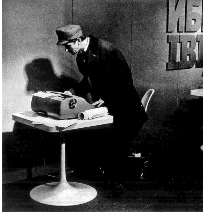
Fig. 12. IBM's pavilion at the exhibition Sistemotekhnika-71 in Leningrad. "A Russian tries his hand at an IBM Selectric typewriter." Notice the base of the desk inspired from Saarinen's tulip table and the transliteration of IBM's logo in Cyrillic on the right.