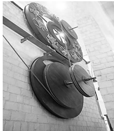
Fig. 1. Castle Clock mechanism

There are many early examples of automation intended for amusement and awe rather than with some practical function. An early example was a mechanical theatre that performed a play, almost ten minutes in length, invented by Hero of Alexandria (c10-70 AD) and powered by a complex system of ropes and machines operated by a rotating cylindrical cogwheel that produced the sound of thunder by use of metal balls dropped onto a hidden drum and mechanically-timed [2]. It could be argued that this involved an early example of programming [6]. Another early example appears in the way that a 10 th century Byzantine emperor impressed barbarians at his court by the presence of automata including lions roaring on either side of his throne, and birds resting on the surrounding trees singing harmoniously [2]. To the naïve observer in his court these would have been seen as rather magical and to have been operating independently.