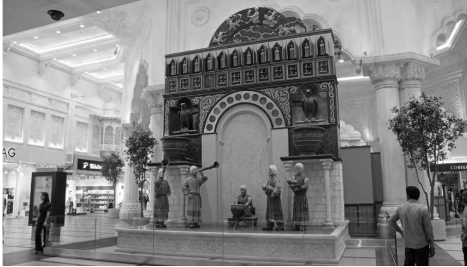
Fig. 2. Castle Clock. This is a reconstruction of the clock by Al-Jazari [7] (in Ibn Battuta Mall, Dubai) from his ‘Book of Knowledge of Ingenious Mechanical Devices’.

In Europe from the middle ages there are many more examples of automata, including a number of mechanical astronomical clocks that began to appear in the 14 th century.