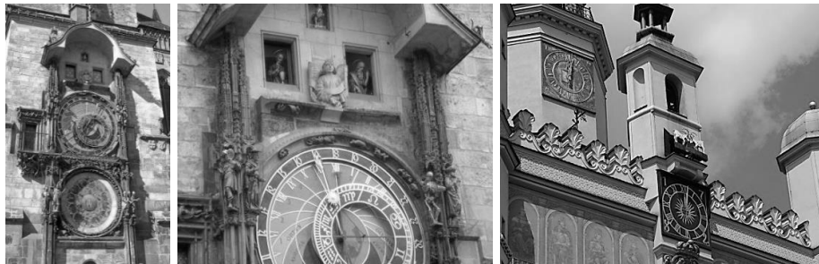
Fig. 3. Astronomical Clocks: Prague (Czech Republic) and Poznań Goats (Poland)

In Europe from the middle ages there are many more examples of automata, including a number of mechanical astronomical clocks that began to appear in the 14 th century.