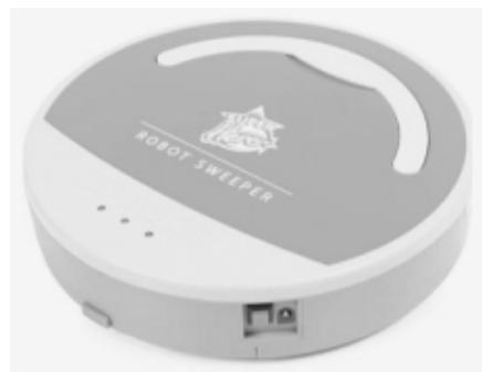
Fig. 5. Robot vacuum cleaner

Actor-network theory (ANT) has been around since the mid-1980s and was developed by Bruno Latour, Michel Callon and John Law [17-24] in an attempt to give a significant voice to technological artefacts as they considered that both social and technical determinism were flawed. ANT was designed instead to give a socio-technical account in which neither social nor technical positions are privileged [18, 24] and nothing is purely social or purely technical [25]. ANT asserts that the world is full of hybrid entities [26] containing both human and non-human elements. One could question, for instance, which of the contributions to a piece of software are due to some aspect of the computer hardware, compiler or programming language tools and which are the result of human interactions and the particular likes and preferences of the human programmer [27].