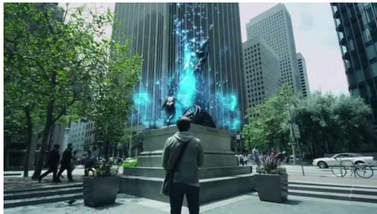
Fig. 1. Ingress promotional video: XM (in blue) flows from the portal (the fountain).

Ingress catch phrase "The World around you is not what it seems" introduces the story of the recent discovery of a strange energy (Exotic Matter, or XM) which flows from portals distributed around the world. Ingress promotional images are self-explanatory (Fig. 1).