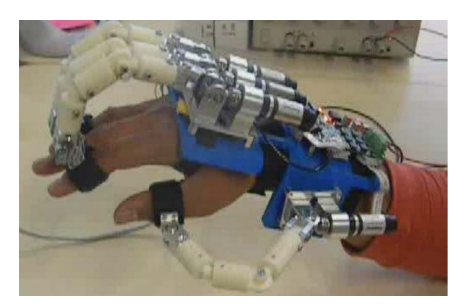
(a) In et al. [143], [144]