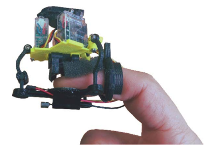
(a) Gabardi et al. [85]