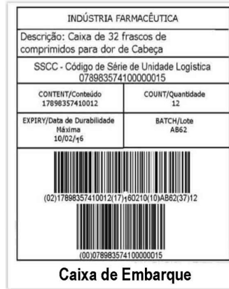
Fig. 2. Label aggregation

and constitute a new code. This new label "father" must be fixed in the shipment box to identify the "children" [8].