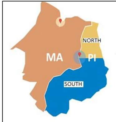
Fig. 3. Map according to the classification

The results of the study, showed a sort of cities concentrate on the central location at the above regions, considering the criterion of the amount of costs and receipts. The analyze of quantitative data resulted in the Cities demonstrated in Column 3 (City Correspondent) of Table1. According to the processes results, were analyzed qualitative data that approached the result for larger cities.