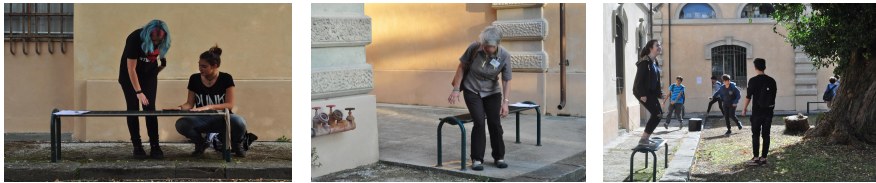
Figure 4. Audience Engagement

I was also concerned about adapting the piece for people with visual impairments, who would have less choice about their movement within the exhibition environment but experience perhaps more sensitivity towards a range of sonic variations. As such, people with visual impairments might find much to engage with in terms of sounds and vibrations within the piece that otherwise may not be available to them in other interactive art examples.