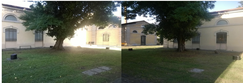
Figure 1. Sonic Space #05 onsite

third bench. The three 'actors' play together, exploring how their movements can trigger simultaneous sound sources that resonates across the building of the garden. Furthermore, as individuals walk over the ramp, a flowing sound is played back from a new loudspeaker. Similarly, as the public audience taps on the wall surface a new burst of sound will propagate through the adjacent loudspeaker. The five persons can decide to play at all times or not and intensify their awareness of the urban soundscape which previously went inaudible.