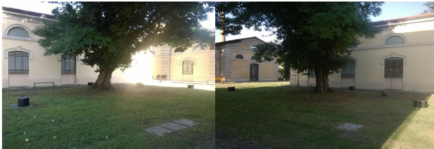
Figure 1. Sonic Space #05 onsite

third bench. The three 'actors' play together, exploring how their movements can trigger simultaneous sound sources that resonates across the building of the garden. Furthermore, as individuals walk over the ramp, a flowing sound is played back from a new loudspeaker. Similarly, as the public audience taps on the wall surface a new burst of sound will propagate through the adjacent loudspeaker. The five persons can decide to play at all times or not and intensify their awareness of the urban soundscape which previously went inaudible.