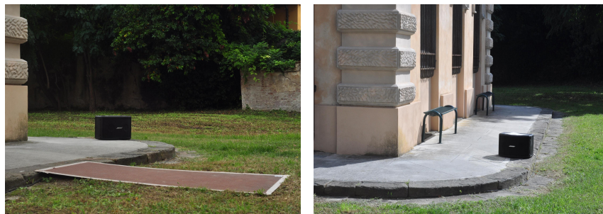
Figure 2. Close view on interactive ramp on site

Sonic Space #05 is set up in an outdoor environment that demanded we be extremely aware of the challenges of wrecking, rigid weather conditions, and conservation issues in sketching the tangible body of the work. Additionally, I aimed to create a work that was visually welcoming to the public, as well as actually interactive.