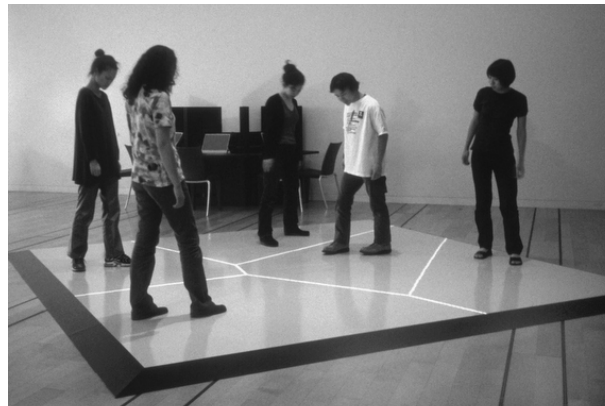
Fig. 2. S. Snibbe, “Boundary Functions” (1998), here presented at the NTT InterCommunication Centre in Tokyo, Japan, in 1999. Image with GFDL licence retrievable on http://en.wikipedia.org/wiki/Scott_Snibbe

artists to work with interactivity by means of computer-controlled projectors. In particular, one of his most famous works of this kind is “Boundary Functions”, presented for the first time at the “Ars Electronica” festival in Linz, Austria in 1998 and then several other times around the world, concluding at the Milwaukee Art Museum, in Wisconsin, USA in 2008 [17]. The work consists of a projection of geometric lines from above onto a platform on the floor, separating the persons on the platform from one another, as shown in Figure 2. The lines