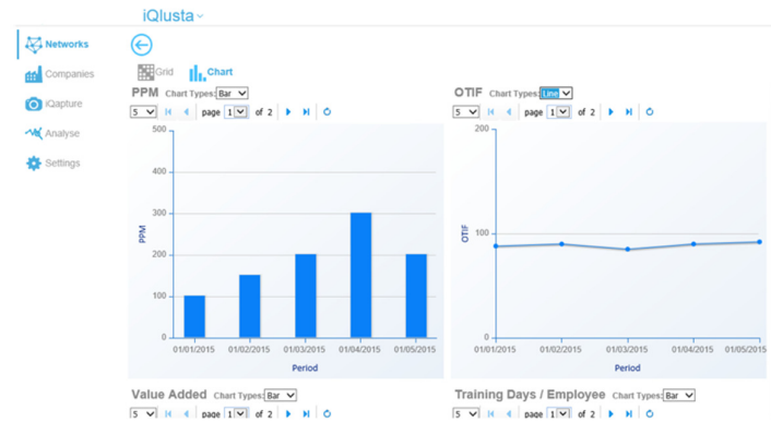
Figure 3 - Display of performance monitoring features