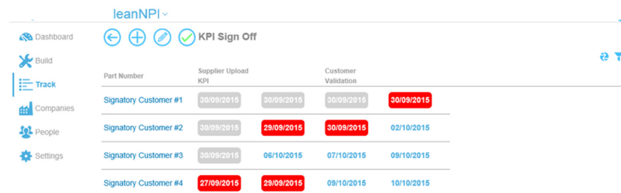
Figure 1 - Display of collaborative project management features for new product introduction (NPI)

The company develops solutions for SMEs, large Primes and Tiers 1, raw materials suppliers and industrial associations. These solutions support visibility and transparency among supply networks in several ways: 1) through the streamlining of operations, 2) the real-time monitoring of risks in the network, 3) the mapping of members' capabilities and 4) through collaborative platforms to support new product introduction, work package management, logistics, etc. In terms of operations, collaboration potentiated by the ICT company's solutions enable customers' relationship management, supply chain management, collaborative inventory management, aggregated procurement, collaborative tendering and collaborative project management. This system could be added to the information systems already reported in the literature and listed in Table 1. For a better understanding of the information systems in study, Figures 1, 2 and 3 provide a snapshot of some of the functionalities embedded in ICT company's solutions.