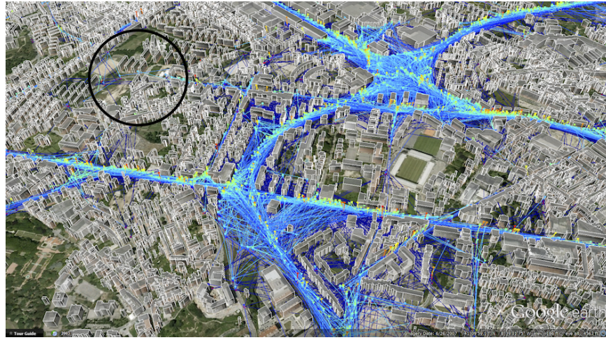
Fig. 1. A snapshot showing exchanged messages between taxis in the city of Porto [18]

One of the interesting examples of ITS applications is the prediction of trip duration for public transportation [15, 16, 17]. Knowing the prediction of trip duration beforehand can be very instructive for taxi companies, passengers, and drivers to make the right decision for the route planning and scheduling by using the data collected about the taxi's trips by each taxi. Fig. 1 shows a snapshot of exchanged messages between taxis in the city of Porto.