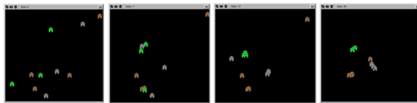
Fig. 1. Organizations behavior at four different instants of simulation (instants 0, 7, 17 e 76) for configuration 5 (Netlogo screenshots).

The final results are the average of the 100 simulations for different number of iterations. In the analysis of the five configurations, the evidence of convergence has the highest value at configuration 2, with the average of 106 iterations. The configuration that presents, on average, a fewer iterations occurs in the configuration 4. A Kruskal Wallis test was applied to verify if the distribution of iterations is the same between the configuration categories, as the permanence rate and the growth rate. The null hypothesis was rejected for a significance level of 0.05 in all three situations. Four different instants of simulation are possible to observe at Fig. 1.