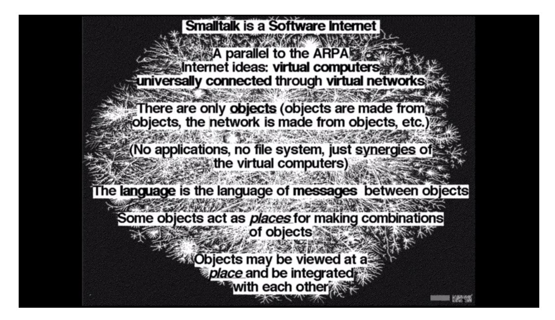
■ Figure 1 A frame from Kay's presentation of the Smalltalk system in his tribute to Ted Nelson [16].

by unifying the notions of program and document . Kay described the Smalltalk system as a "Software Internet" of objects extended and reconfigured by users (Figure 1). HyperCard allowed users to construct simple utility software as interconnected cards : Documents consisting of pictures and text with embedded programs. Smalltalk and HyperCard users could remix and extend existing software, and share it with other users. Both the Smalltalk image and HyperCard stacks are versions of a distributed docuverse of software.