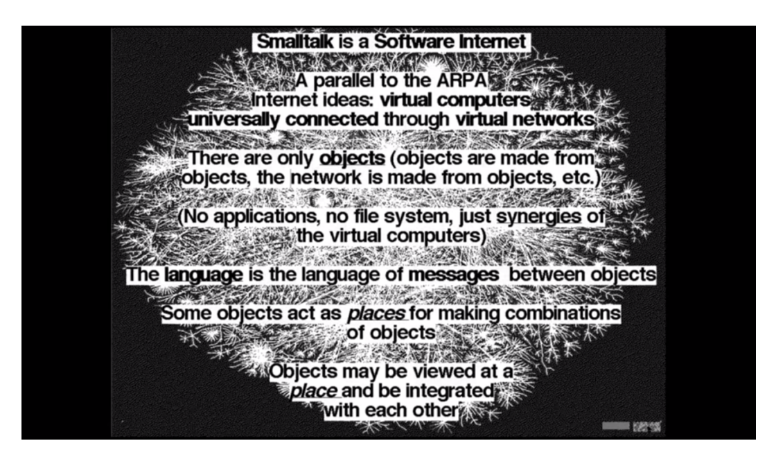
Figure 1 A frame from Kay's presentation of the Smalltalk system in his tribute to Ted Nelson [ Kay2014 ].

language and system developed at Xerox PARC [Kay1993]. Each of these systems made a leap in abstraction by unifying the notions of program and document . Kay described the Smalltalk system as a "Software Internet" of objects extended and reconfigured by users (Figure ??). HyperCard allowed users to construct simple utility software as interconnected cards : Documents consisting of pictures and text with embedded programs. Smalltalk and HyperCard users could remix and extend existing software, and share it with other users. Both the Smalltalk image and HyperCard stacks are versions of a distributed docuverse of software.