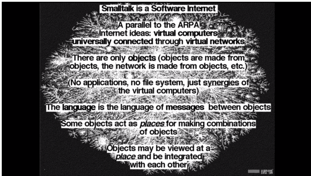
■ Figure 1 A frame from Kay’s presentation of the Smalltalk system in his tribute to Ted Nelson [Kay2014].

language and system developed at Xerox PARC [Kay1993]. Each of these systems made a leap in abstraction by unifying the notions of program and document . Kay described the Smalltalk system as a “Software Internet” of objects extended and reconfigured by users (Figure ??). HyperCard allowed users to construct simple utility software as interconnected cards : Documents consisting of pictures and text with embedded programs. Smalltalk and HyperCard users could remix and extend existing software, and share it with other users. Both the Smalltalk image and HyperCard stacks are versions of a distributed docuverse of software.