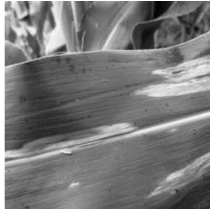
Fig. 5. 10 times decoding image using proposed algorithm

The comparison of proposed algorithm with the original Jacquin algorithm is shown in Table 1, the PSNR (peak signal-to-noise ratio) is calculated as follows: