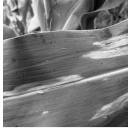
Fig. 5. 10 times decoding image using proposed algorithm

The comparison of proposed algorithm with the original Jacquin algorithm is shown in Table 1, the PSNR (peak signal-to-noise ratio) is calculated as follows: