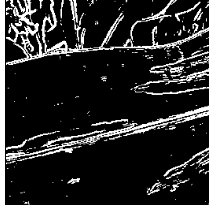
Fig.3. The detailed image after calculating by Sobel operator