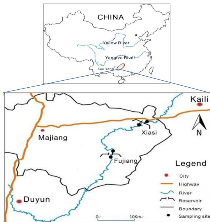
Fig. 1 Location of the sapling sites

Qingshui river is located in the Guizhou province, southwest China, which is 459km long and cover 17,145 square kilometers in the watershed. Duyun and Kaili are two major cities in this watershed. In this study, GHGs were collected at the water surfaces of upstream and downstream of Fujiang hydropower station (weak human activity) and Xiasi hydropower station (strong human activity). Locations of the study site were shown in Figure 1.