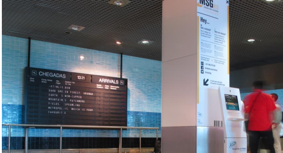
Fig. 1. The MStoryG installation deployed at the airport's baggage claim area.

In the next sections we describe MStoryG's final case study at the regional (international) airport (see Figure 1), including the installation, design process, and implementation.