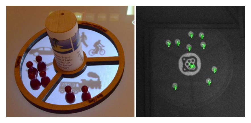
Fig. 2. The final design of the Tangible Voting widget (left); detection via reacTIVision (right).

The original layout from the game show which inspired the Tangible Voting technique had three separate zones aligned on one axis. As the typical widget design we are working with features a marker, we chose to align the different input zones in a circular manner with the marker hidden in their centre (see Figure 2 left). This makes the widget resemble a pie chart. We used a diameter of 15cm and three zones. The enclosing is physical, with its bottom supported by a thin transparent plastic film to allow users to lift, drop, and reposition the widget without impacting votes that have already been cast. We embedded the widget label indicating the question on a flat, vertical board (third prototype) first, then on a cylinder placed in the centre of the widget (fourth prototype). The rationale was that such a 3D label may facilitate reading the text from a lower perspective and be memorized more easily compared to a flat, horizontal label.