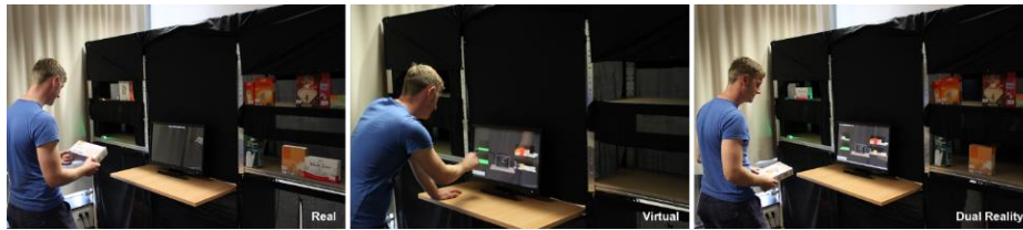
Fig. 1. Environment in the real, virtual and Dual Reality conditions

The schematic setup is shown in Figure 2 and is the same for all three conditions. The worlds are designed in exactly the same way, illustrated in Figure 1. For the virtual version, we used a 3D scene displayed on a 2D touchscreen for representing a virtual version of the real world.