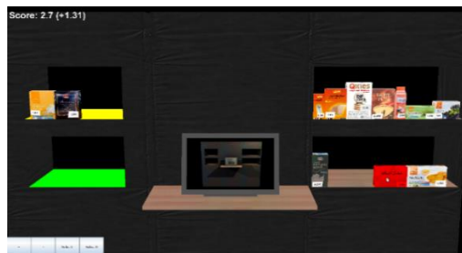
Fig. 4. Setup in the virtual world condition

We designed the virtual world to be as similar as possible to the real world in order to ensure comparability. Therefore we decided against a 2D representation and used a 3D view instead. A screenshot of the virtual model is shown in Figure 4. For additional functions such as switching views between shelves or zooming, several command buttons are displayed in the lower left corner of the interface.