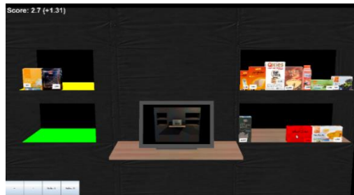
Fig. 4. Setup in the virtual world condition

We designed the virtual world to be as similar as possible to the real world in order to ensure comparability. Therefore we decided against a 2D representation and used a 3D view instead. A screenshot of the virtual model is shown in Figure 4. For additional functions such as switching views between shelves or zooming, several command buttons are displayed in the lower left corner of the interface.