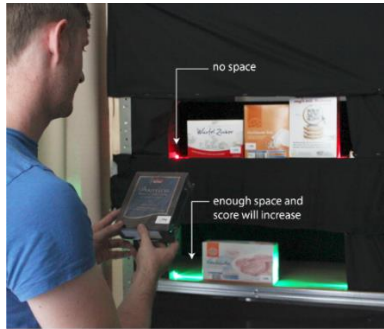
Fig. 3. Lights indicate available space and score

The subject uses real products and shelves to accomplish the task. We implemented several assistance systems, which should help the subject in achieving a good score, without reducing the cognitive effort too much. We displayed the actual score as well as the change with respect to the last step on the screen between the shelves, giving the subject an idea of whether his actions were going in the right direction. Additionally, we installed LED lights in different colors on each shelf of the left shelf unit (target shelf). As soon as the subject touches a product or holds it in his hands, the LEDs are turned on, indicating if there is not enough space to place the product (red light); there is enough space, but the score would decrease (yellow light); or there is enough space and the score would increase (green light) after placing the product (see Figure 3).