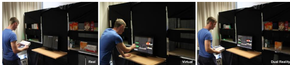
Fig. 1. Environment in the real, virtual and Dual Reality conditions

The schematic setup is shown in Figure 2 and is the same for all three conditions. The worlds are designed in exactly the same way, illustrated in Figure 1. For the virtual version, we used a 3D scene displayed on a 2D touchscreen for representing a virtual version of the real world.