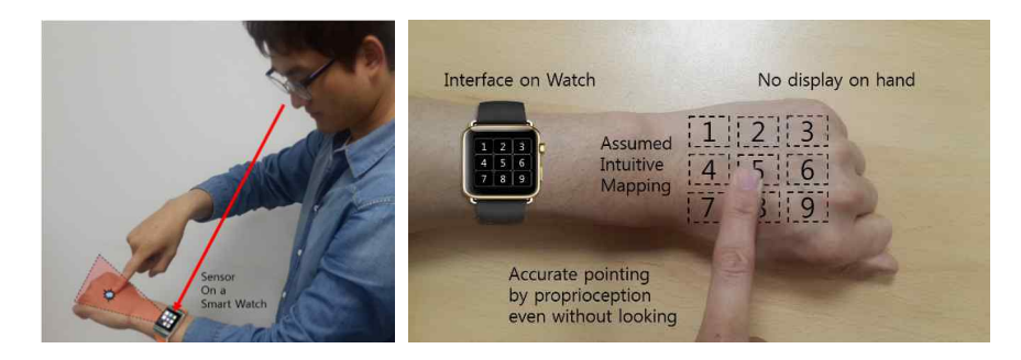
Fig. 1. The concept of the proprioception based "Touch Skin" input method for a small screen device.

To realize "Touch Skin", sensing movement or position on skin surface and installing such a capability on the smart watch will be the major technical challenge. We believe that, for example, a smart watch equipped with a depth or ultrasonic sensor on its side can detect finger position on the palm at sufficient resolution to realize our proposal (see Figure 1). In this study, however, as a first step, we explore whether the proposed interaction scheme will perform sufficiently or comparable to that of the smart phone (for certain major tasks) through an enactment study (i.e. pretending as if the finger/skin tracking is operational).