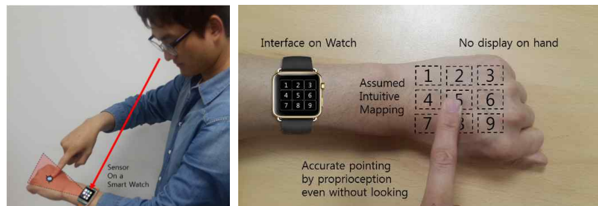
Fig. 1. The concept of the proprioception based “Touch Skin” input method for a small screen device.

To realize “Touch Skin”, sensing movement or position on skin surface and installing such a capability on the smart watch will be the major technical challenge. We believe that, for example, a smart watch equipped with a depth or ultrasonic sensor on its side can detect finger position on the palm at sufficient resolution to realize our proposal (see Figure 1). In this study, however, as a first step, we explore whether the proposed interaction scheme will perform sufficiently or comparable to that of the smart phone (for certain major tasks) through an enactment study (i.e. pretending as if the finger/skin tracking is operational).