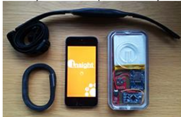
Fig. 3. Data collection using Jawbone UP, chest-strap heart monitor, data-logger and app

A bespoke heart beat data logger was developed to collect data wirelessly from a commercial chest strap heart sensor. The inter-beat intervals are used to calculate heart rate and HRV. Many ways exist of calculating HRV [e.g. see 5], and the one employed here was the commonly-used approach of using standard deviation of inter-beat intervals over fixed time windows. This sensing method enables reliable data to be collected in a relatively non-invasive and power efficient way.