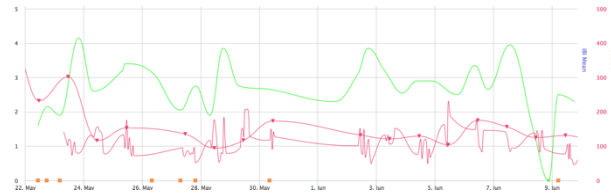
Fig. 5. Data zoomed and filtered to explore link between HRV and thoughts of self-harm

and complex picture, and is likely to be of limited use in discerning any pattern. However, the view provides filtering and zooming, allowing the user to interact with the data to investigate more specific patterns and relationships (e.g., see Fig. 5 ). Currently, data visualizations are at a prototype stage, and suitable for researchers rather than patients. Future development will create visualizations that enable patients to explore and better understand their own behavioral signatures.