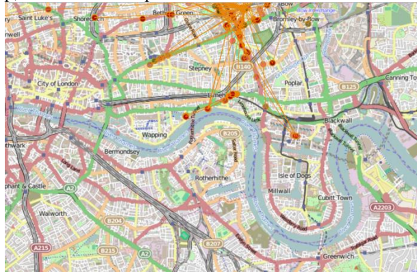
Fig. 4. Geo-view showing user's movement

To this end, the Insight system provides two main visualization tools: a map and a timeline, which are linked so that selections in one view (e.g. to select only a portion of the timeline data) filters data displayed in the other view (e.g. to show only locations logged during the selected time window). This approach has proved successful in other contexts where an analyst attempts to make sense of related temporal and geographical data [13]. The Geo-view (Fig. 4) shows the locations logged by the smartphone app, overlaid on a map.