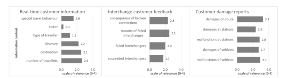
Fig. 2. Appraisals of the relevance of the content of automated customer feedback

The assessments of the relevance of customer information for dispatching decisions show considerable differences according to the type and content of information. For instance, the survey reveals that the real-time information about travelers is most relevant as an aggregation of the number of interchangers per connection (cf. fig. 2). Furthermore, additional information, such as destinations and itineraries of travelers, can provide valuable information about travel alternatives and allow conclusions about the prioritization and the characteristics of the required decisions. Direct customer feedback can not only comprise the success of interchanges, but also the reasons and consequences of failures from the travelers' point of view. Due to the fact, that this customer feedback could provide valuable data for the evaluation of the dispatching quality in retrospect, the relevance of this information is mainly rated moderately. In contrast to the previous customer information and feedback, the relevance of damage reports by customers is rated high and very high, especially by the dispatchers of regional transport companies. Due to the fact, that the regional dispatchers also often supervise the according infrastructure, such as tram wires and station facilities, these results indicate the highest acceptance and need of automated customer information.