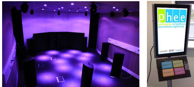
Fig. 1: The 3D Sound Room and the digital tool in simulated cardiothoracic ward environment

The experiment was conducted in the 3D Sound Room, as shown in Fig. 1 (left), in the International Digital Laboratory, at the University of Warwick. It consists of a 16-speaker system and 3 projector displays. It enables a 3D visual and aural simulation to a hospital environment. A cardiothoracic (CT) hospital ward environment was simulated using previously obtained sound recordings and images.