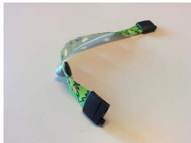
Fig. 2. Original prototype bracelet with an NFC tag embedded in a widget

With the NFC tags suitably housed the next step was to create a means to turn this individual item into a playlist. A simple bracelet was chosen as shown in Fig. 2 below, as each widget could then be customized to produce something akin to a charm bracelet.