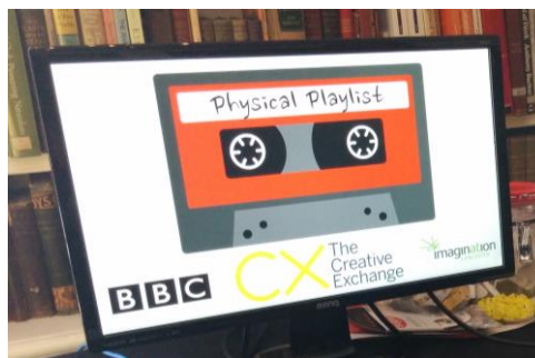
Fig. 5. Playback screen of the Physical Playlist.

As for the actual playback of the playlist itself, the player, is in fact an Arduino 9 connected to a RaspberryPi 10 and transmits the data read from the tag via serial connection where it is then decoded and added to the playlist stored on the RaspberryPi. The playlist begins to play when the first tag is scanned and the arm continues to move down the playlist scanning until it encounters the next unread tag, this is then added to the playlist and the player ceases its movement until the previous track is completed. This is slow technology as was originally coined but also represents its more recent consideration as a way of slowing down the consumption of media [8]. The playback screen on the monitor is shown in Fig. 5 .